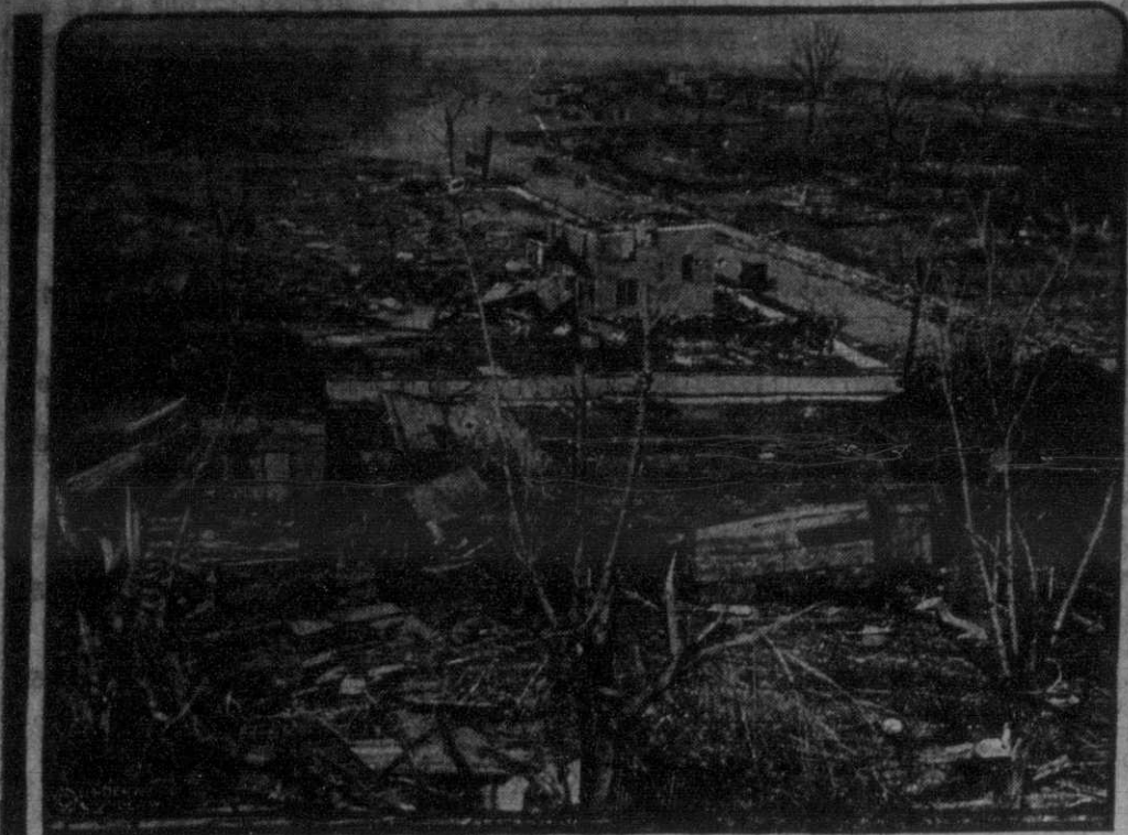
This is a panoramic view of the devastation caused throughout southern Illinois by the recent hurricane in which hundreds of lives were lost, many hundreds of people seriously injured, and millions of dollars' worth of damage resulted.