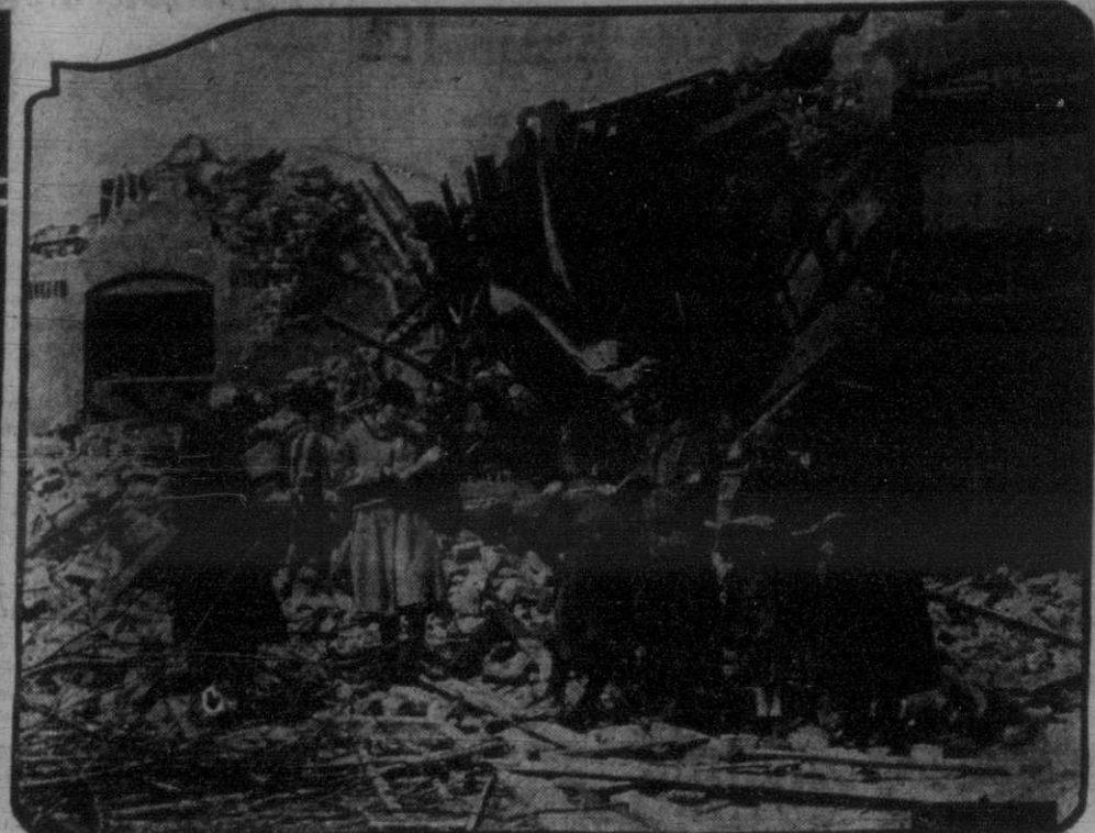
Late estimates are that 83 pupils were killed when the tornado struck this building, known as the Logan school. Besides the many killed when the twister demolished the building, scores were so badly injured that a number have since died.