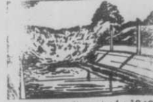
This is where Chevrolet for 1949 was PROVED to be weather-proof and waterproof!

At the General Motors Proving Ground there are men who are experts at ruining cars! "Find the flaws . . . get the facts" is their motto. And so, when Chevrolet for 1949 was delivered to their "tender" mercy, they put it through its paces so vigorously and so thoroughly that there was no chance for basic weaknesses to go undetected. What a break for the buyer . . .