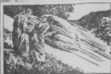
Proved on the toughest grades . . . the new Chevrolet takes hills in its stride. Its power will thrill you.

Mile after mile they put it through its paces . . . proved its speed, its acceleration, its economy!