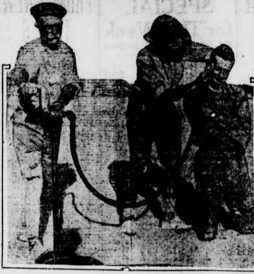
Tommy Atkins in Egypt submits to sheep shearing machinery for a hair cut, for lack of other instruments. Two "barbers" are here shown giving Tommy a shear.