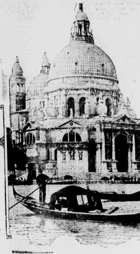
PREPARING FOR THE FOE IN VENICE. The wonder city of art and architecture is yet untouched by the hand of the foe, but it is a city denuded of its art treasures...