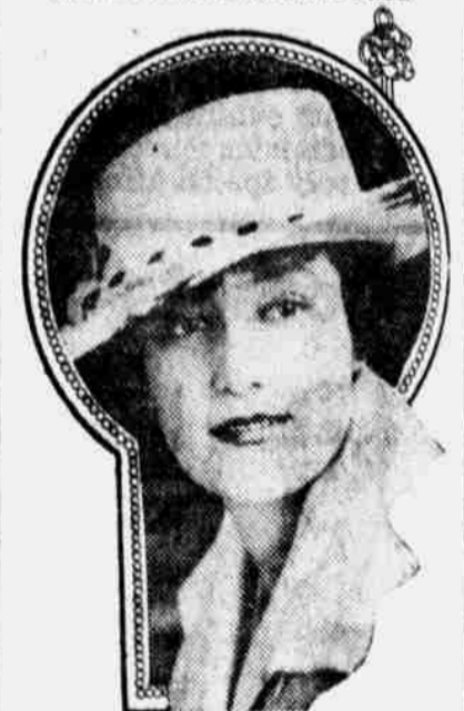
Stuart's Calcium Wafers Surely do Give a Lovely Complexion.

The reason why Stuart's Calcium Wafers tend to seek the surface. The wonderful calcium sulfate is one of the natural constituents of the human body. You must have it to be healthy. It enriches the blood, invigorates skin health, dries up the pimples and boils eczema and blotches, enables new skin of fine texture to form and become clear, pinkish, smooth as velvet and refined to the point of loveliness and beauty. This is how to be beautiful. Stop using creams, lotions, powders and bleaches which merely hide for the moment. Get a 50-cent box of Stuart's Calcium Wafers at any drug store today. And if you wish to give them a trial send the coupon below.