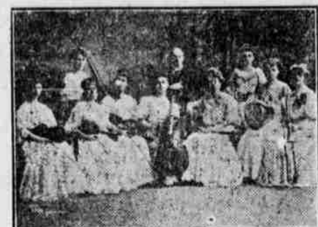
21 The Cleveland Ladies' Orchestra A Superb Musical Attraction

Strong lectures on live topics. Entertainers the very best ever. First-class music, in varieties to suit every taste. Indian school—new features. GET A SEASON TICKET EARLY.