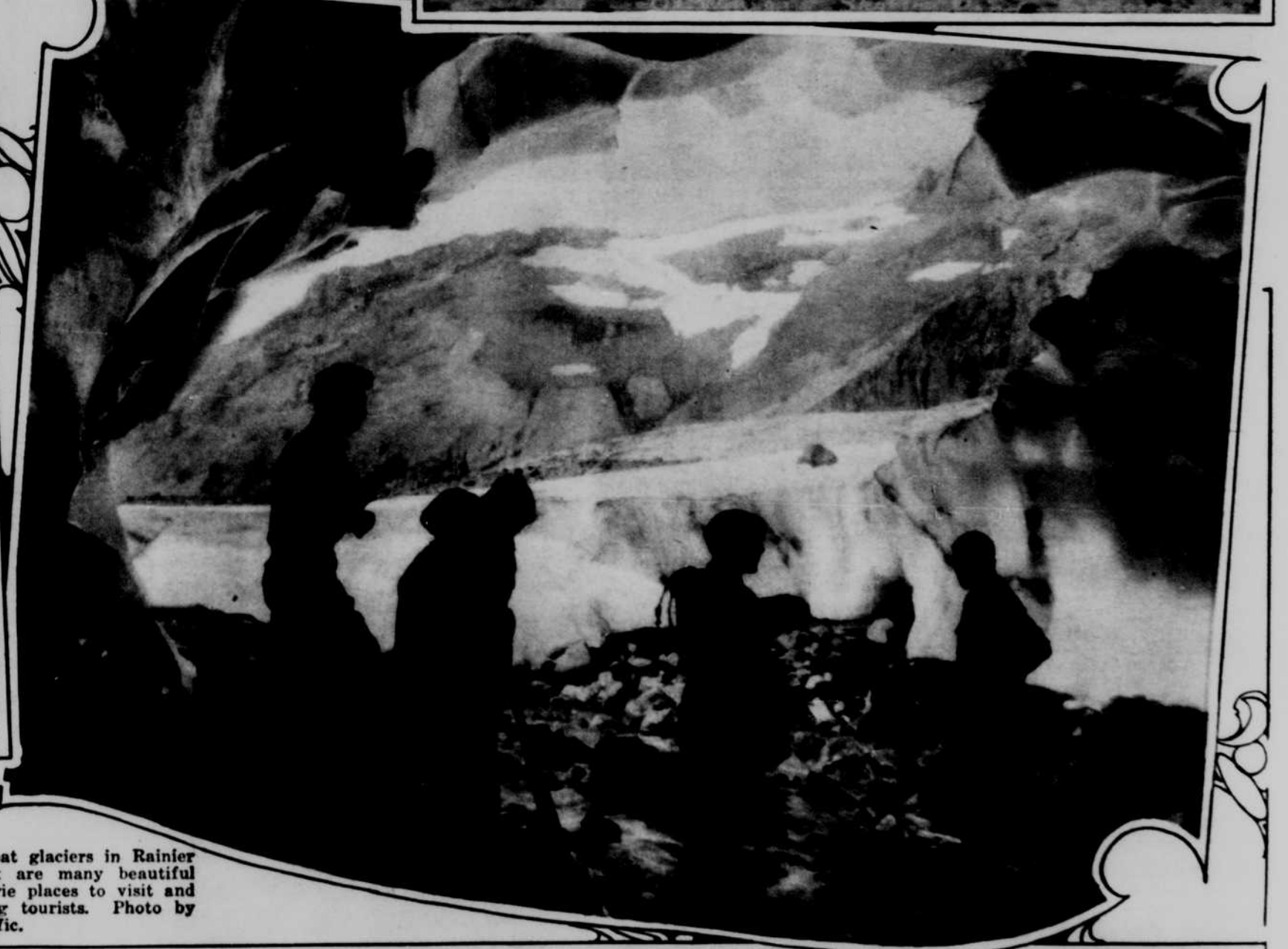
In the 28 great glaciers in Rainier National park are many beautiful ice caves—erie places to visit and popular among tourists.