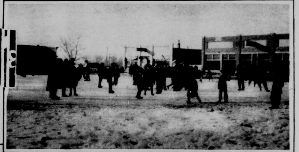
They enjoy life out in Wausa in Knox county, Nebraska. In the winter time vacant lots on West Broadway are flooded, electric lights for night skating are installed and everybody, young and old, joins in the fun.