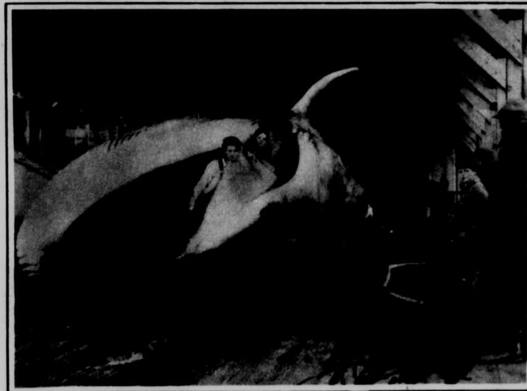
From fin-back whales, like this one, whale oil and whalebone are obtained. There are recorded less than 50 United States vessels engaged in whaling today, although it was once a leading American industry. This picture was taken in Bay City, Washington, where whales measuring from 50 to 70 feet and weighing 27 tons are no great novelty.