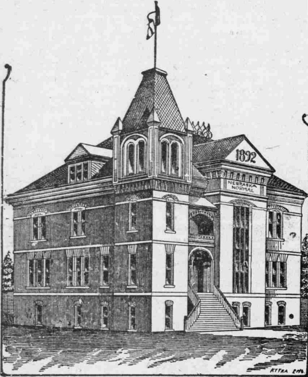
MAIN COLLEGE BUILDINGS AND GROUNDS.