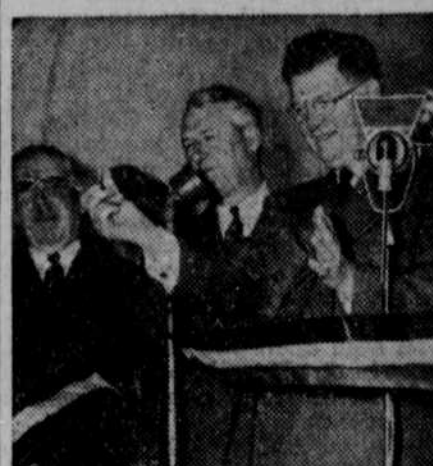
Mayor Edward J. Kelly of Chicago cuts a ribbon in the central station of his city's new five-mile subway. A few minutes later trains were roaring through the $40,000,000 tubes which are being operated by the elevated lines.