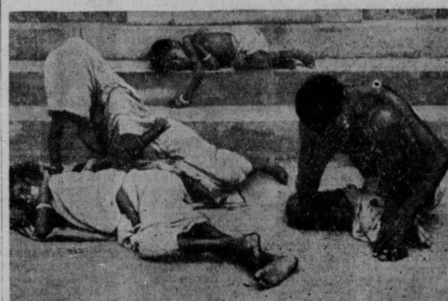
A dying Indian family is pictured on the streets of Calcutta where 250 persons perished daily in the worst famine to strike India for decades. This scene was typical of the condition in India as appeals were made for Allied assistance in the form of "mercy ships" bearing food. The famine was reported to have killed 25,000 in Bengal within four months.