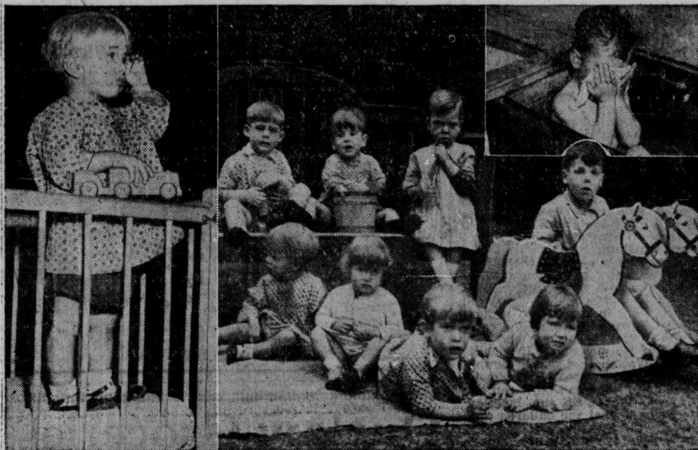
Hundreds of English children whose parents have been killed and whose homes have been destroyed during the war are being nourished back to health and guided in the ways of normal childhood at the Hanover Lodge Nursery in London. Some were so shocked by the noise and destruction of war that they may never recover. Left: One of England's "homeless generation" bravely salutes in her crib. Center: In the garden the children pose for the cameraman. Top right: This modest young man covers his face as he is photographed while being given a bath. The nursery was formerly the home of a wealthy American girl.