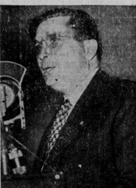
Wendell Willkie, GOP presidential nominee in the last election and a current prospect for 1944, is pictured speaking in St. Louis where he suggested stabilized world currency.