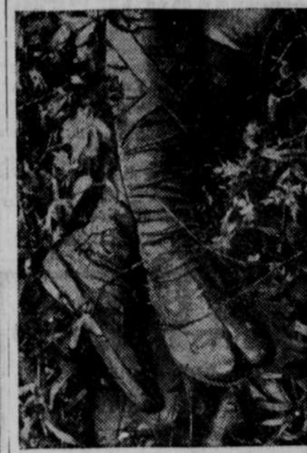
This split-toe type of shoe, pictured on a dead Jap soldier in the Solomons, is worn by those who, as civilians, were accustomed to open sandals fastened by a strap between the toes.