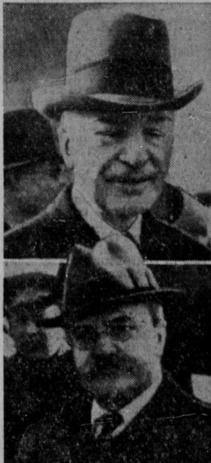
Top: United States Secretary of State Cordell Hull as he arrived in Moscow to confer with Russia's foreign commissar, Vyacheslav Molotov, bottom, and British Foreign Secretary Anthony Eden, on matters pertaining to the war.