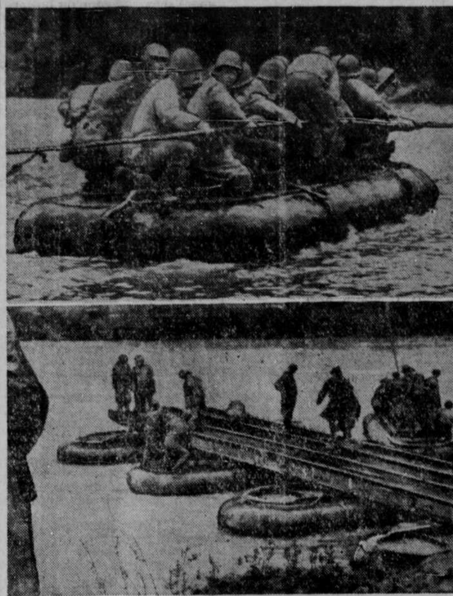
Despite strong German defensive action, Allied forces pushed across the Volturno river in their steady northward march over Italy. Top: American infantry troops tow themselves across the strategic river on a rubber pontoon. Bottom: A group of American soldiers pitch a steel pontoon bridge across the Volturno while a sentinel guards against snipers.