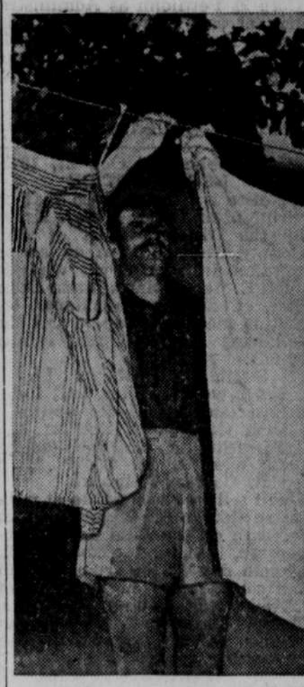
An Italian war prisoner hangs out his laundry "somewhere in America." Prisoners get clothing, good food and are paid for work. Officers are paid according to rank. In American camps prisoners get $3 a month whether they work or not.