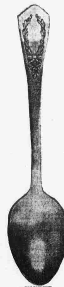
YOU'REX MARJO-NELL PATTERN.