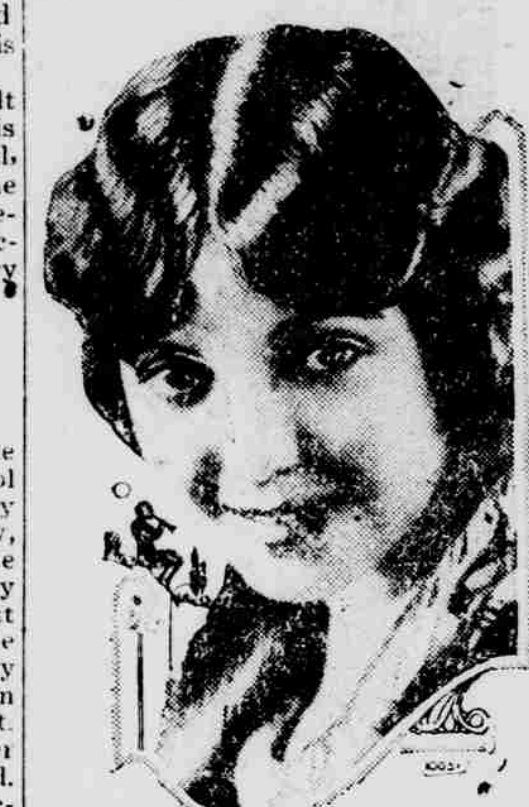
Lila Lee in William DeMille's Production "Midsummer Madness" A Paramount Picture AT PASTIME THEATRE TODAY AND TOMORROW

Personal contact and getting the others' viewpoint are the plain work tools one requires in fashioning a workable body. I want credit to go to the person who does the work and I propose to see that this is done. I want every person in the postal service to try to do a little better each day than the thing he has been doing rather than a man would try to do a thing and make a mistake than not to try at all.