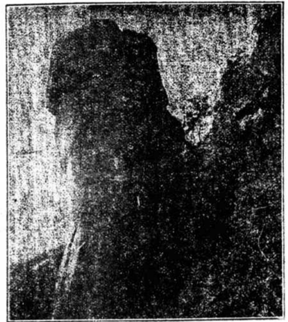
Chimney Rock, spectacular monolith, attracts visitors from all over the world and is reached over excellent motor road, just 18 miles east of Hendersonville.

From the top of Chimney Rock a breath-taking, stupendous, en-circling panorama unfolds! Mighty crags and towering cliffs, the water-torn Hickory Nut Gorge of great depth, range on range of the Blue Ridge mountains softened by mystic haze, and far below the emerald waters of incomparable Lake Lure, with the Piedmont plain stretching to the eastward.