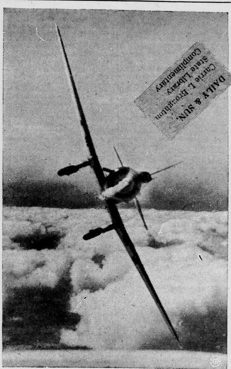
Banking above a level sea of billowy clouds over Randolph Field, Texas, this army training plane makes a picture of peace in sky far removed from scenes of aerial warfare abroad we so often see.