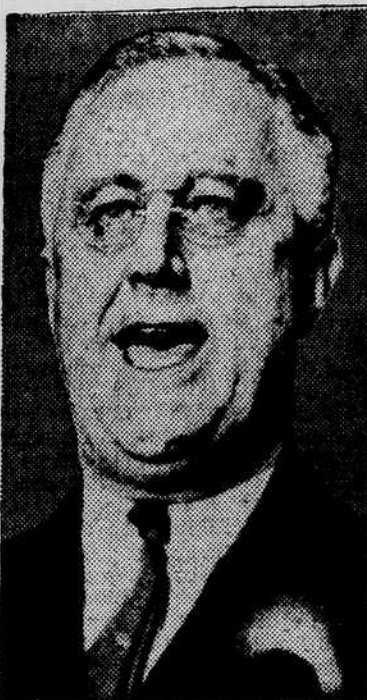
WE DO NOT PROPOSE TO TAKE HITLER'S ORDERS LYING DOWN!

For example, I have in my possession a secret map made in Germany by Hitler's government—by the planners of the New World order. It is a map of South America and a part of Central America, as Hitler proposed to reorganize it. Today in this area there are 14 separate countries. The geographical experts of Berlin, however, have ruthlessly obliterated all existing boundary lines; and have divided South America into five vassal states, bringing the whole continent under their domination. And, they have also so arranged it that the territory of one of these new puppet states includes