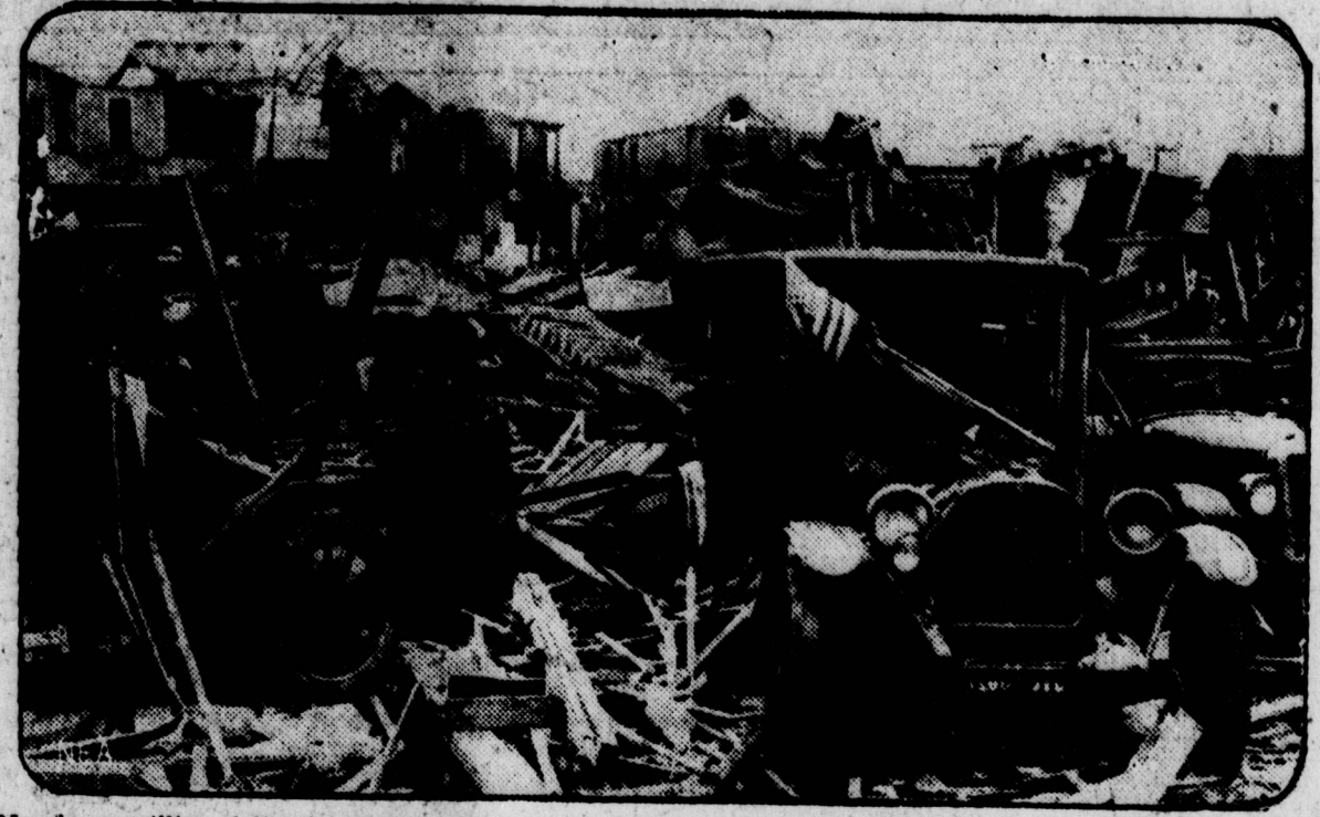
Nearly a million dollars' worth of property was destroyed and more than 40 people were injured when a sudden tornado swooped down on Indianapolis just at dusk. This picture shows how wreckage torn from houses nearly buried a row of automobiles parked by the curb in a residence district.