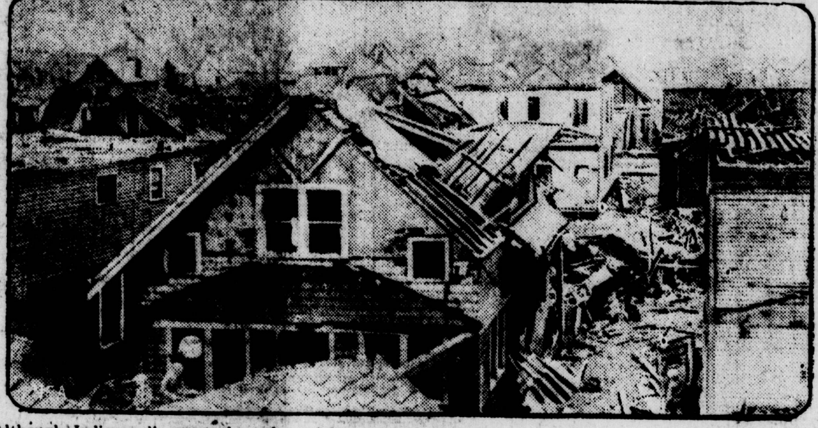
Although Indianapolis went through a violent tornado without loss of life, houses in certain residence districts looked as if they had been under shell fire. This shows a section of frame dwellings unroofed and battered by the howling wind, which struck just at dusk and without warning.