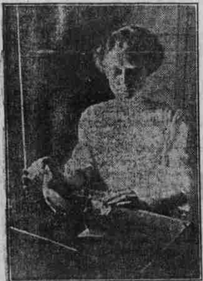
Washing Paper Money.

The custom of circulating soiled bank notes, of course, gives the counterfeiter his best opportunity. Forgery is much more readily detected in a crisp, stiff, new bill than in a rumpled and dirty one.