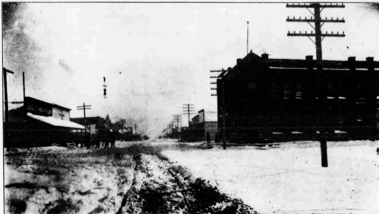
Main Street East From First National Bank—Eighteen Inches of Snow 22nd Day of November, 1906