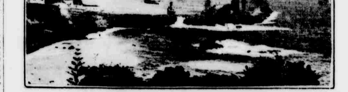
A bird's-eye view of Magdalena Bay, in which the United States was refused a permanent coaling station by the Mexican government.

It would make an ideal American naval base, both for offensive and defensive campaign, and reports indicate that the Japs have had it in mind.