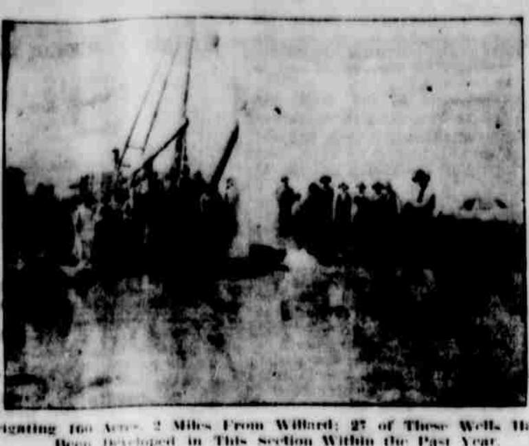
Illustrating 100 Acres 2 Miles From Willard; 27 of These Wells Have Been Developed in This Section Within the Past Year.

With the amount of rain that has fallen during the past few weeks, the reports from all portions of the territory indicate that the coming season will yield abundant harvests. The reports from the farmers are all bright and cheerful, and they all expect a very good stand of cereals. The reports from the farmers in the northern part of the territory are all bright and cheerful, and they all expect a very good stand of cereals. The reports from the farmers in the southern part of the territory are all bright and cheerful, and they all expect a very good stand of cereals. The reports from the farmers in the western part of the territory are all bright and cheerful, and they all expect a very good stand of cereals. The reports from the farmers in the eastern part of the territory are all bright and cheerful, and they all expect a very good stand of cereals.