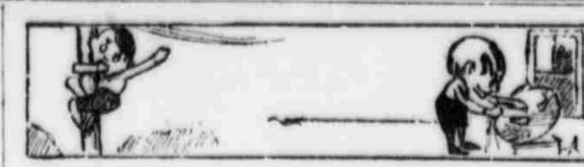
STRANGE AND UNACCOUNTABLE—OR HOW TO BE A BOY.

The treatment by The Herald in last night's issue of the petition that I presented that any other block in the city outside the paving zone that has been established and the test would consequently be more severe. I was immediately accused of selfish desires and the hammer were brought out. It was evidently that thought that worked in the ponderous brains of our council that caused them to shy at such a stupendous order.