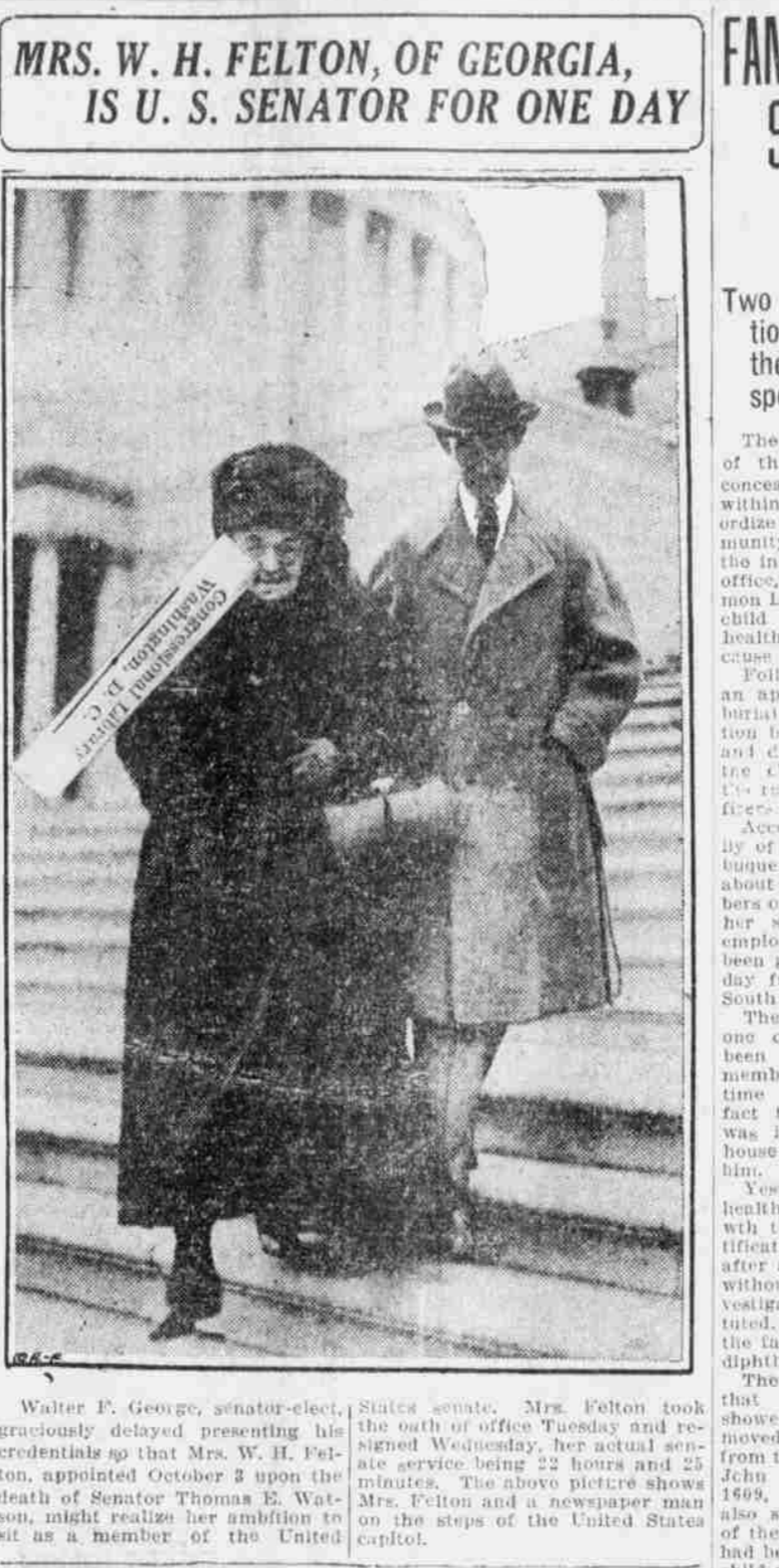
Walter F. George, senator-elect, gradually delayed presenting his credentials today to Mrs. W. H. Felton, appointed October 2 upon the death of Senator Thomas E. Watson, might realize her ambition to sit as a member of the United States senate.

Will Assist the American Federation of Labor in Presenting Its Argument Urging Impeachment