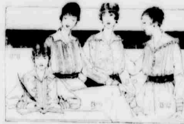
The New Withmore Waists on Sale Tomorrow. As Always, $1.00. As Always, Worth More.

They're Wonderful Waists for $1.00 and they show what modern factory and store-keeping methods can accomplish, when applied to the making and selling of Waists