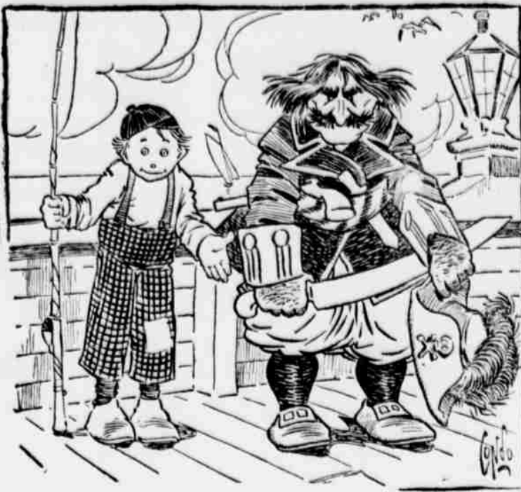
ROBERT. FLAKEY CRUST.

Readers, this is Robert, on the left. He is the hero. This, on the right, is Flakey Crust, the pirate. Readers, Robert, Flakey Crust, Robert and Flakey Crust, the Readers. Consider yourselves introduced.