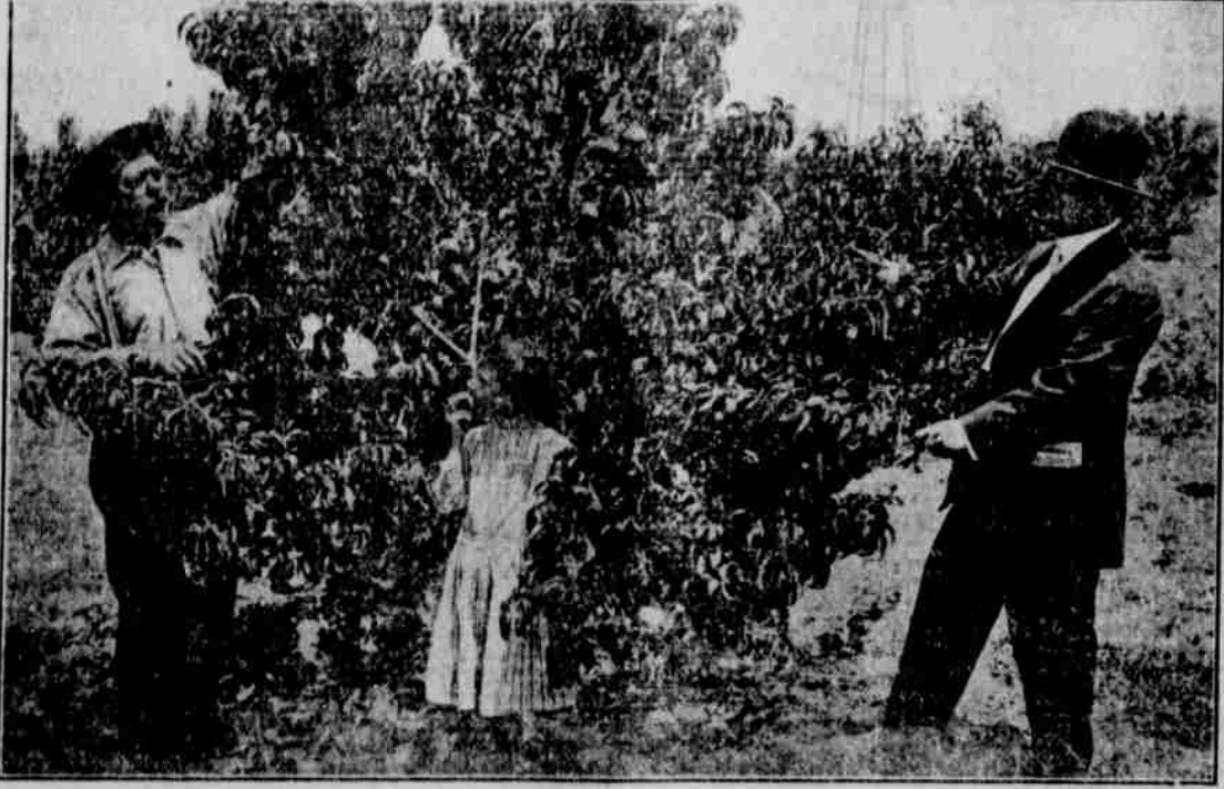
A LOWER RIO GRANDE VALLEY ORCHARD.