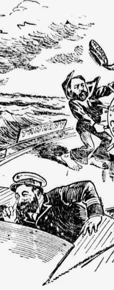
"And when the breezes blow I generally go below."—Sir Joseph Croker, K. C. B.