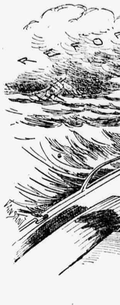
"And when the breezes blow I generally go below."—Sir Joseph Croker, K. C. B.