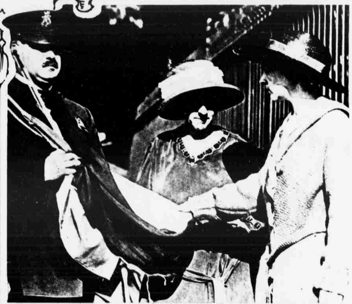
Suffragette grasping at banner seized by policeman just outside the White House gates. Many of the women pickets were arrested.