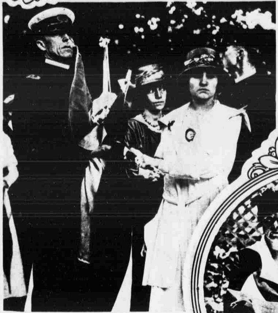
Washington policeman with confiscated suffrage banner and one of the fourteen pickets arrested outside the White House recently. Because of the inflammatory inscriptions on the flags trouble was had protecting the women.