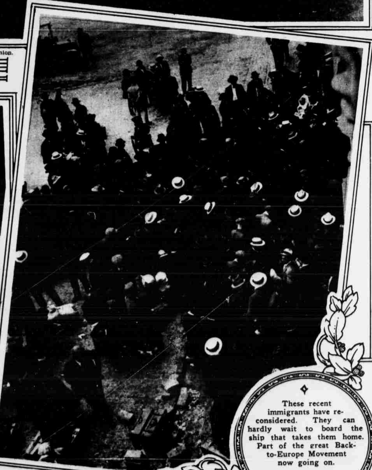
These recent immigrants have re-considered. They can hardly wait to board the ship that takes them home. Part of the great Back-to-Europe Movement now going on.