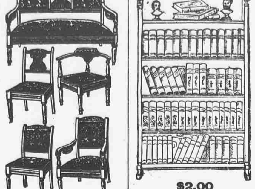
Regular Price $4.00. For this Fine Solid Antique Oak Book Stand, 80 inches high by 30 inches wide.

We have reduced the price on every article in our warerooms fully 33 per cent. for this week in order to reduce our surplus stock.