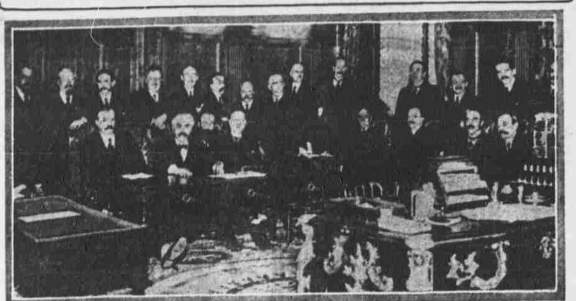
One of the first things Premier Millerand and his Cabinet did after assuming office to conduct the affairs of France was to pose for the photographers. The new Premier is seen seated, the second from the left.

A commission already has been given to a famous artist to paint a picture of the Cabinet from this photograph, and the painting will be preserved to posterity. The new Premier is seen seated, the second from the left.