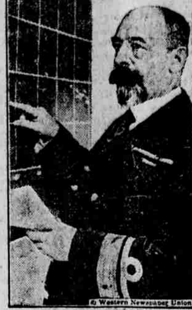
Commodore Wells organized the system by which United States troops and supplies were conveyed to Europe.

Latest Photograph of Commodore of the British Navy.