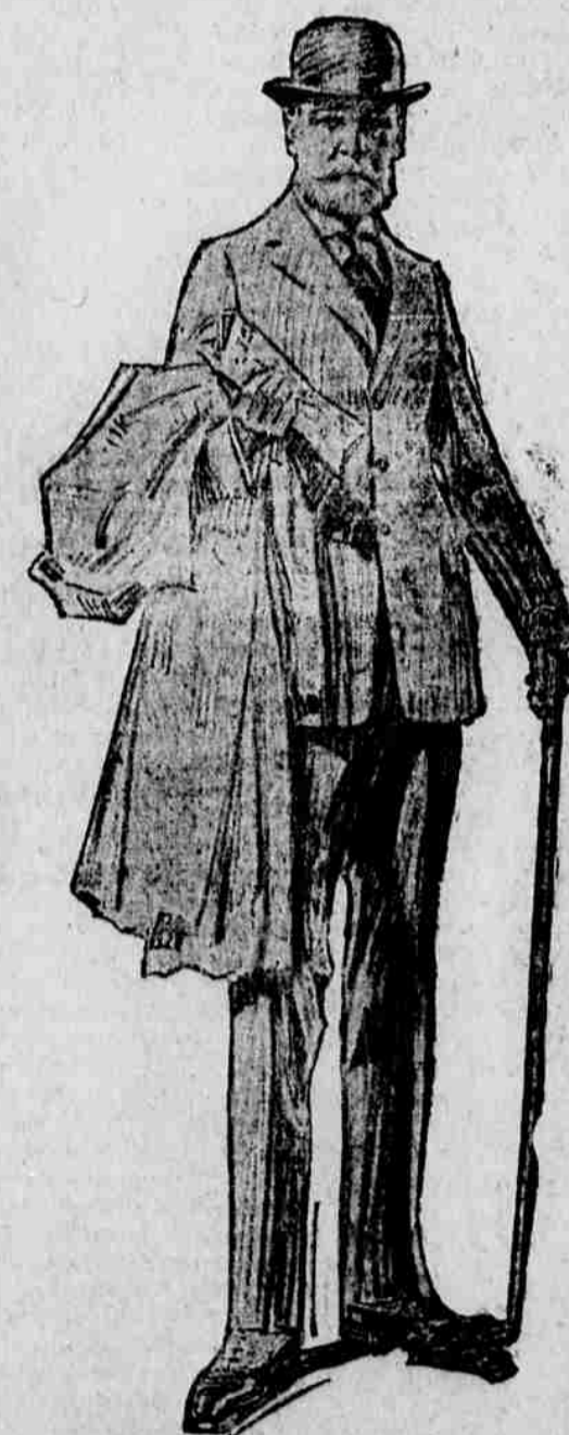
Copyright 1919 Hart Schaffner & Marx

There's not a man in this town, of any age or shape that we haven't just the right clothes for.