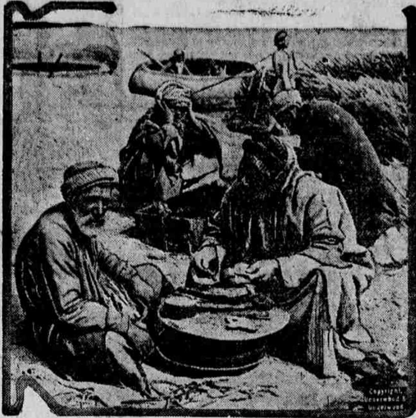
Bedouins eating in their camp near Bagdad, one of the greatest cities in all the old Turkish empire. The Bedouins are wandering clans who seldom stay more than one year in the same locality. Their half Gypsy life will not be much changed by British or allied rule in Mesopotamia. Mesopotamia's farm lands now produce food enough for less than a million people. With modern irrigation methods in the Tigris and Euphrates valleys the region could feed twenty million people.