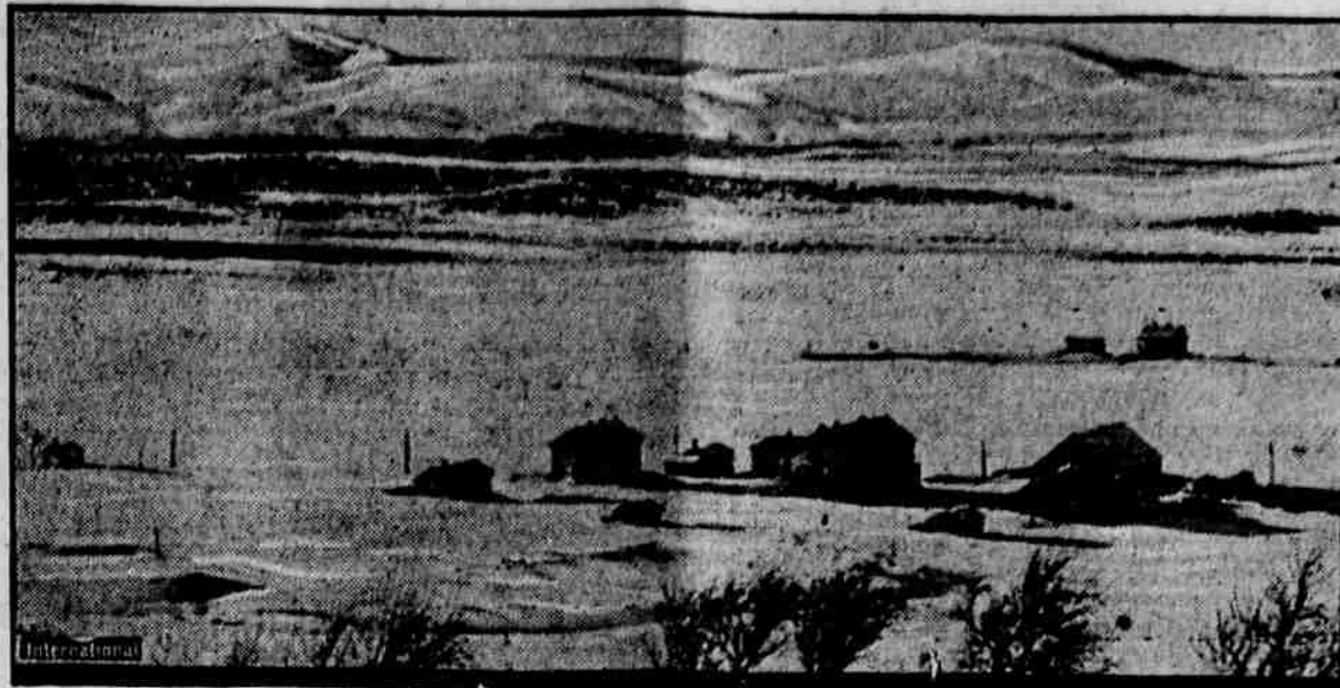
Here is the railroad station amid the mountains at Trondheim, in Norway, which has just been erected for the Grand Trunk railroad which runs from the north to the south of Norway. The station is the highest in the world, being at an altitude of more than 7,000 feet.