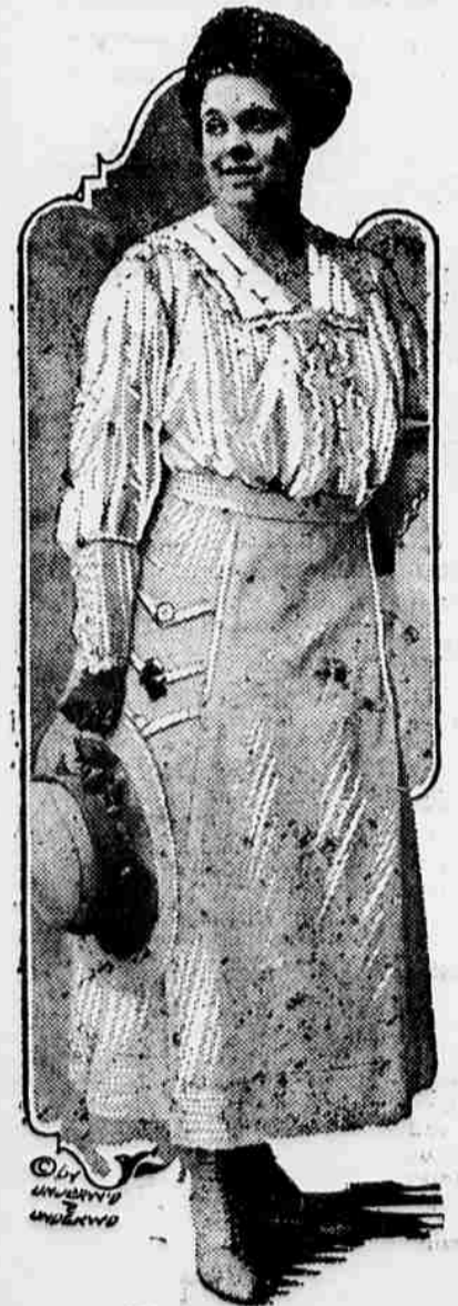
Women who think they are too large to wear separate blouses and skirts, please take notice. This becoming costume shows what has been done to give the large figure the slender effects achieved by the sveltline system of designing.