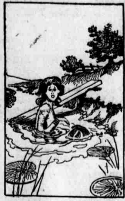
MATTIE IN THE CREEK.

"A BE," said Farmer Beecher as I stopped at his gate the other morning to hand him a letter, "you are a bum poet!" "Farmer Beecher," said I in reply, "you are an infernal liar!" "If you are any sort of a poet why don't you get down and come in?" "What for?" "Because Hattie and Jim Snow were married by rapid transit yesterday."