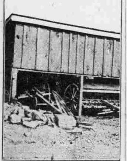
Implements Should Be Cleaned, Greased and Sheltered From the Weather.

(Prepared by the United States Department of Agriculture.) A farm implement that is laid by in bad condition at the end of the season is pretty likely to be found in the same shape, probably worse, in the spring, when the time comes for using it again.