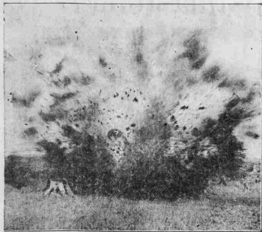
To Blast a Stump Successfully Requires Experience and Judgment.

(Prepared by the United States Department of Agriculture.) Distribution by the United States Department of Agriculture of 12.500 pounds of picric acid salvaged from the war stores and destined to be used for farm explosives will arouse interest in the desirability and practicability of blasting stumps to clear off old wood lots for crop purposes.