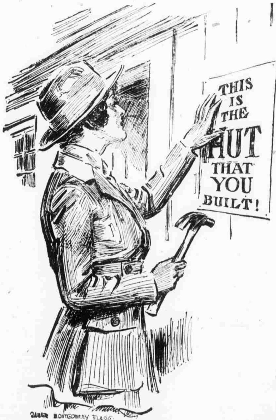
2488 MONTGOMERY FLAGG