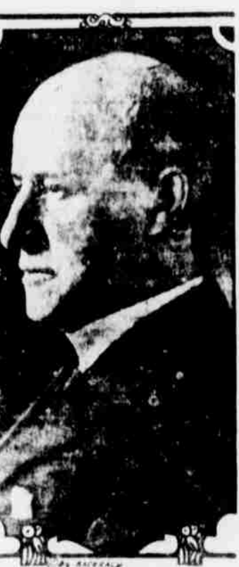
Senator Miles Poindexter