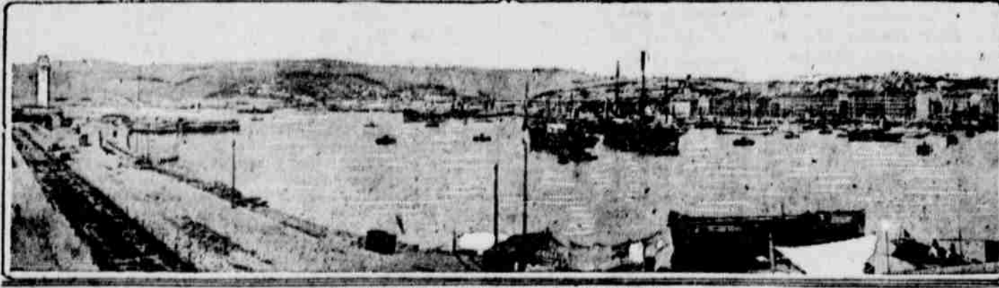
City and harbor of Trieste as they look today.

ROME, Italy, July 30.—The city of Trieste, to gain possession of which was one of Italy's main reasons for going to war with Austria, is prospering under Italian rule, according to a recent report published by the Italian minister of commerce. "Commercial conditions, both as regards maritime and railroad traffic have notably improved," reads the report. "During the first four months of the current year the exportations by water route reached more than 100,000 tons, while during the whole of 1919 they amounted to 120,000 tons. Importations by land route have reached 215,400 tons as compared with 42,200 tons for the four corresponding months of 1919. Maritime and railroad traffic shows for the first four months of 1920 a total increase of 200,000 tons as compared with corresponding months of 1919. It is believed that recent agreements mad between Italy, Czechoslovakia, Austria and Jugoslavia will result in the further development of commerce. Passenger service between Trieste and Vienna and Trieste and Prague, recently instituted, has been functioning since the 8th and 15th of June.