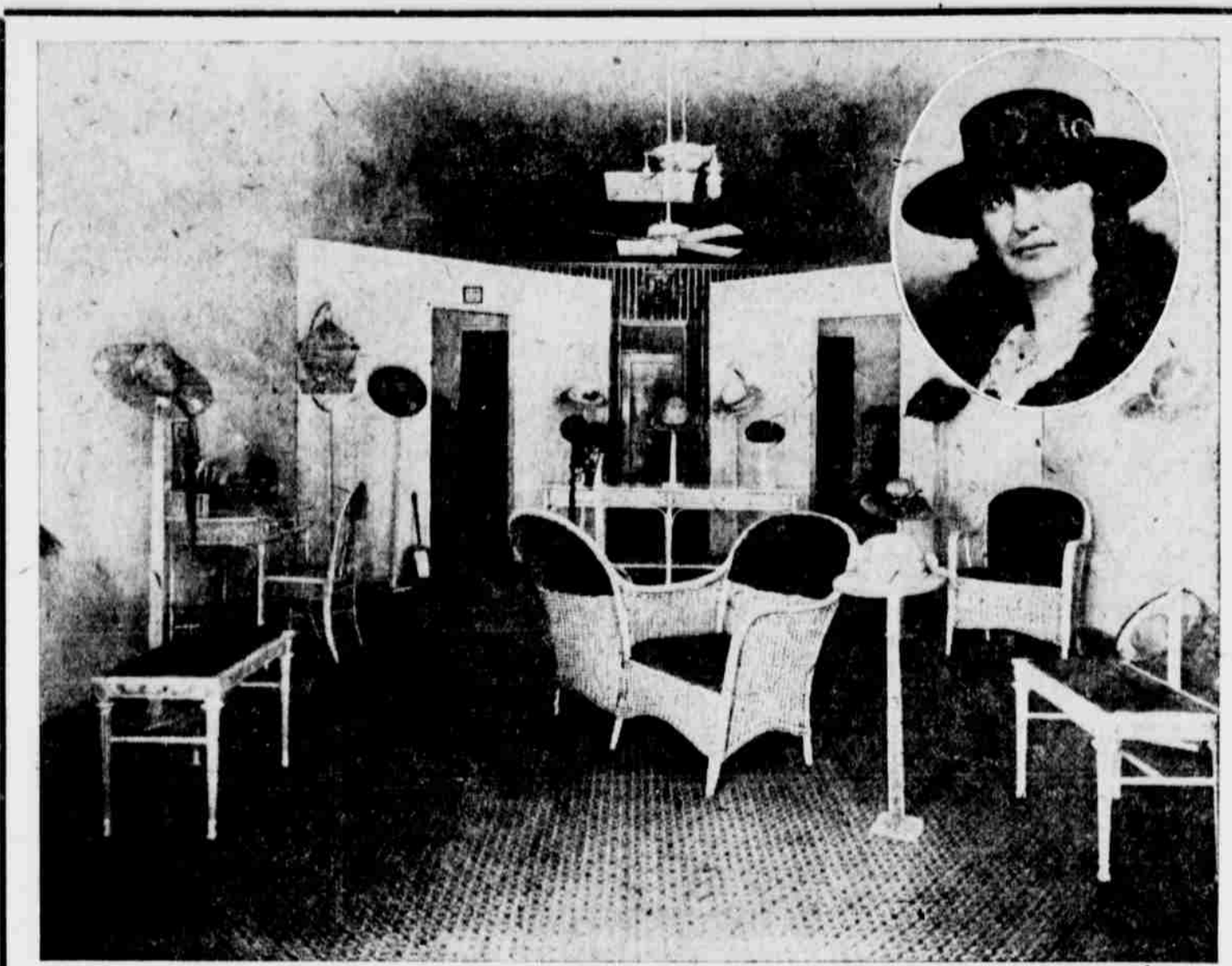
MARIE LOUISE SALON—A SHOP DE LUXE FOR DISCRIMINATING WOMEN