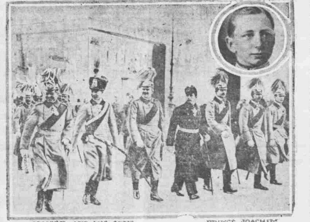
The German War Lord and his son, Prince Joachim, are shown in the photograph at the top of this page. Prince Joachim is shown in the lower photograph. He is 27 years old.