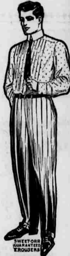
SWEET-ORR GUARANTEED TROUSERS