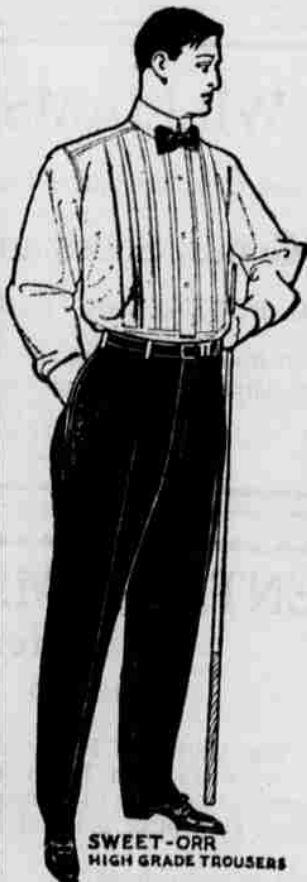
SWEET-ORR HIGH GRADE TROUSERS

Contest open to all men. Three men to compose a team, six in all. Pull to be made as shown in the illustration. Trousers to be held near the crotch, by the first man in each team. Test to be a steady pull. No jerking allowed. If the seams are ripped, the names and sizes of the contestants, together with the pair of damaged trousers, will be forwarded at once to SWEET-ORR & CO., Inc. for the award of the trousers.