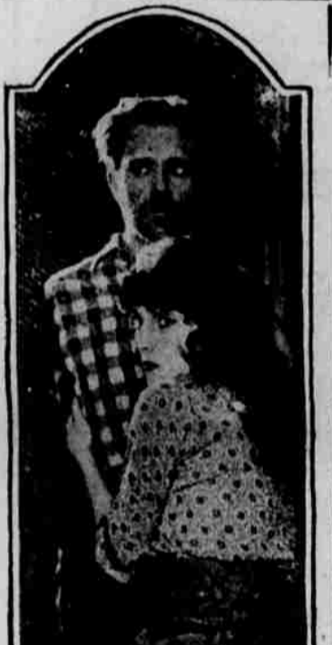
SCENE FROM VITAGRAPH'S 'THE COURAGE OF MARGE O'DOONE' BY JAMES OLIVER CURWOOD A VITAGRAPH SPECIAL PRODUCTION