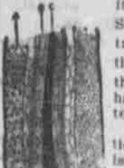
A Healthy Hair