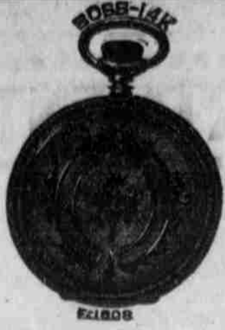
Ladies' watch, Elgin or Waltham, finely jeweled movement, gold-filled case. Warranted for 20 years.