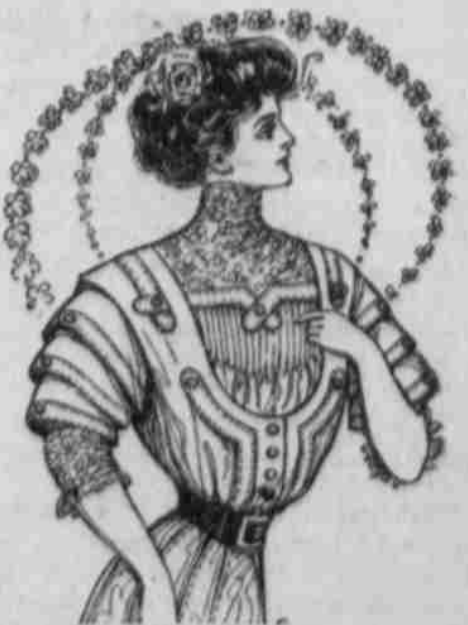
LADIES' LINGERIE WAISTS.

In Panama Worsteds and fancy materials, nicely trimmed, man-tailored and silk lined. $8.50, $10.50, $12.50 and $14.90.