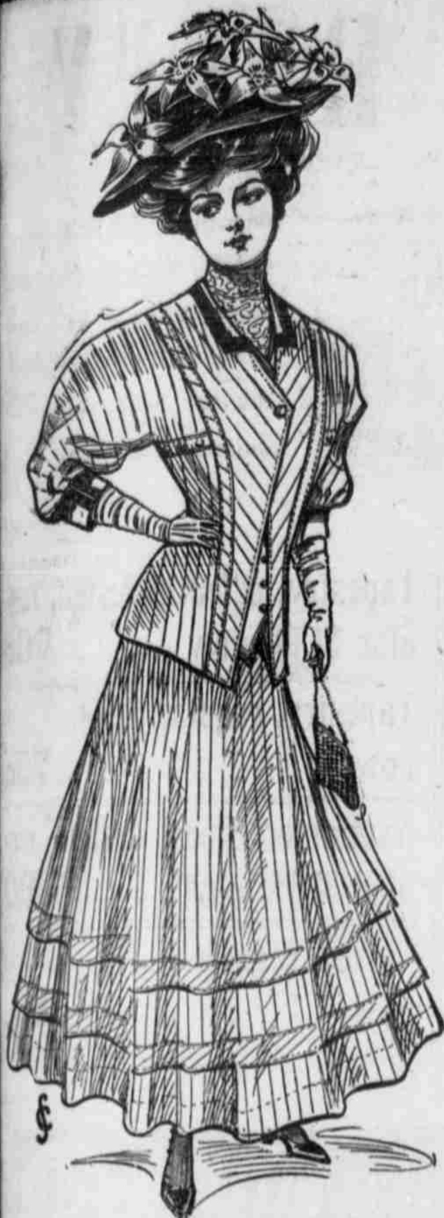
NEW TAILORED SUITS

$13.50 Coats ..... $8.00 $15.00 Coats ..... $9.00 $20.00 Coats ..... $12.50