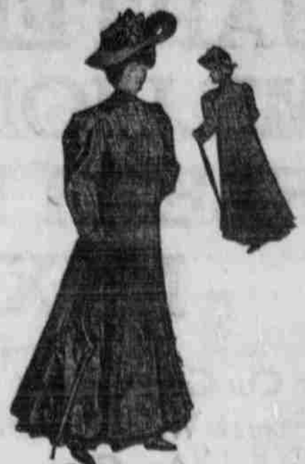
The Kenyon Style 560