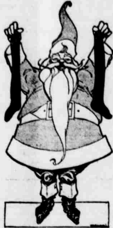
AN IDEAL GIFT

Some member of your family will thank you if you present him with one of our handsome new shirts. We have the latest styles in all sizes; plain and fancy designs $1.50 to $4.50.