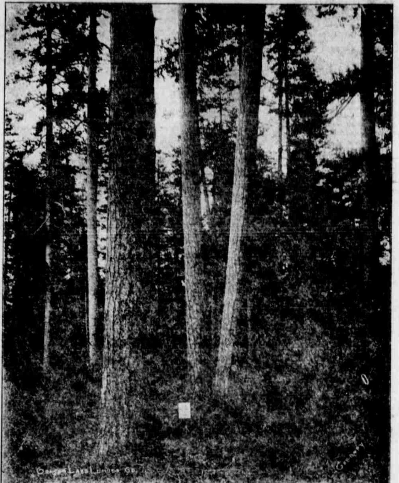
Sugar and Yellow Pine Trees.

All the merchantable timber included in this estimate is of first grade. The trees are long-bodied, towering from 100 to 300 feet, the straight brown trunks free of limbs for many feet up.