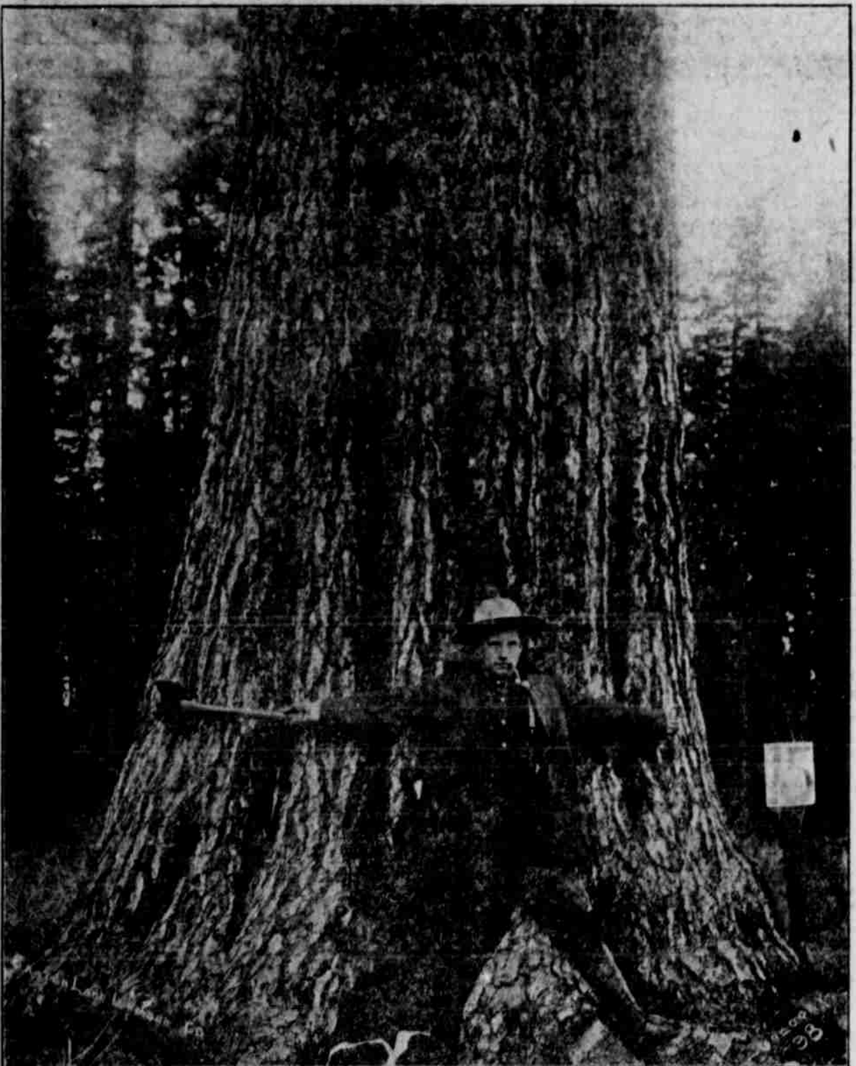
A Sample Sugar Pine Tree.