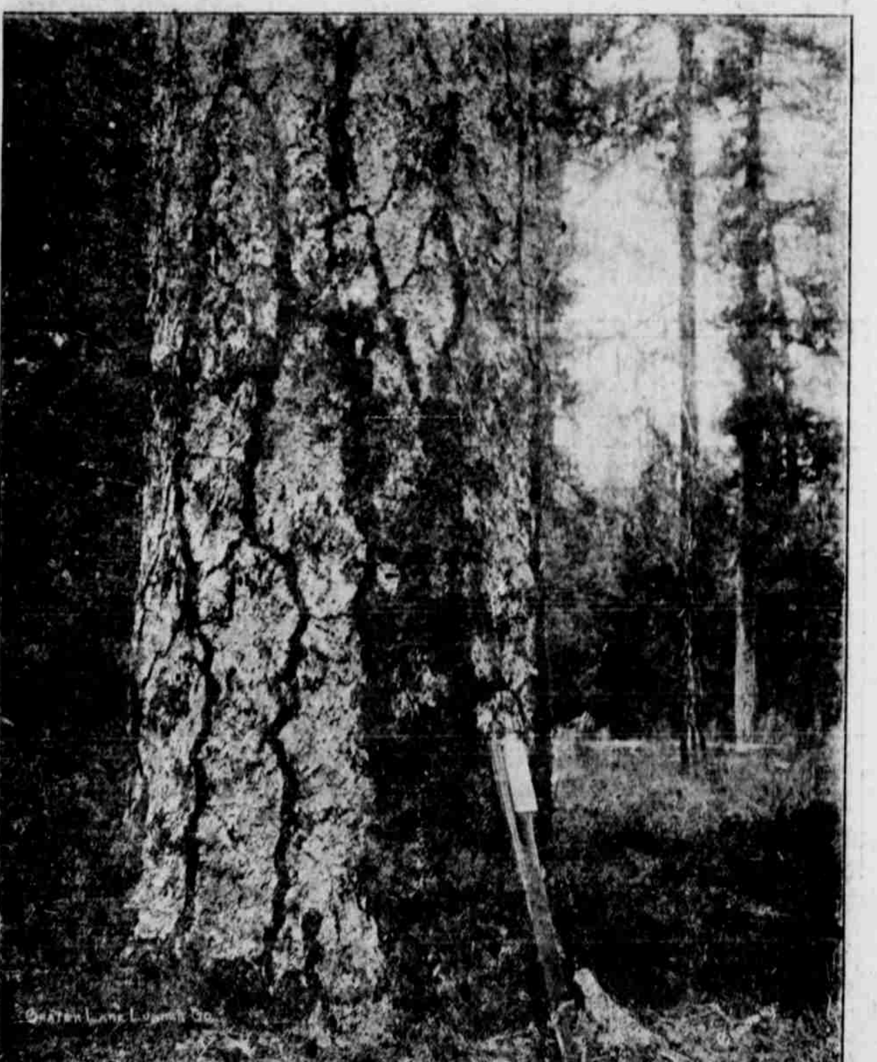
A Sample Yellow Pine Tree.