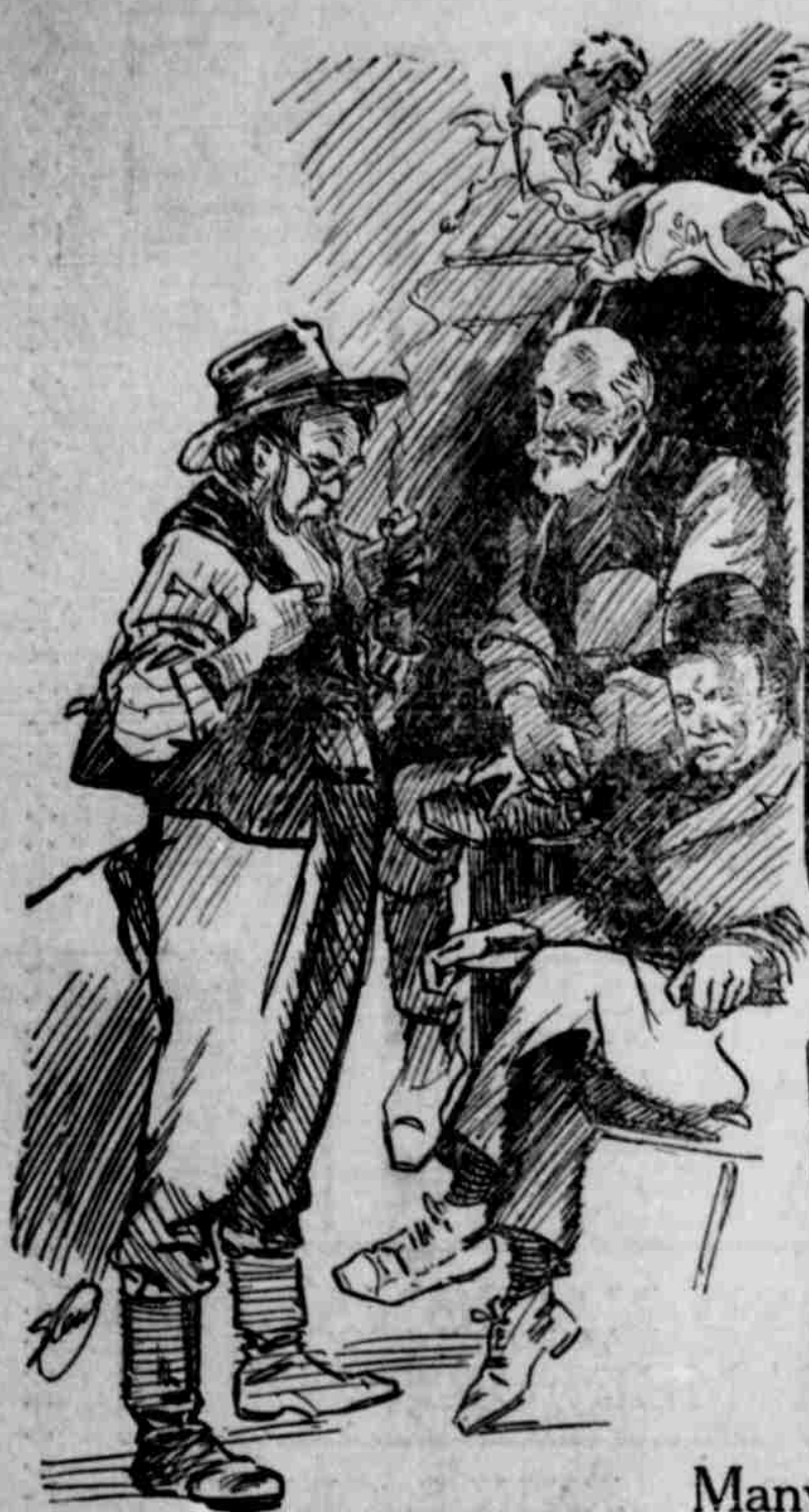
By Fred Lockley.

Few indeed are the western communities that live in their yesterdays. Some there are that live in the present. More, by far, live in the future and capitalize values accordingly, but Jacksonville lives in the past.