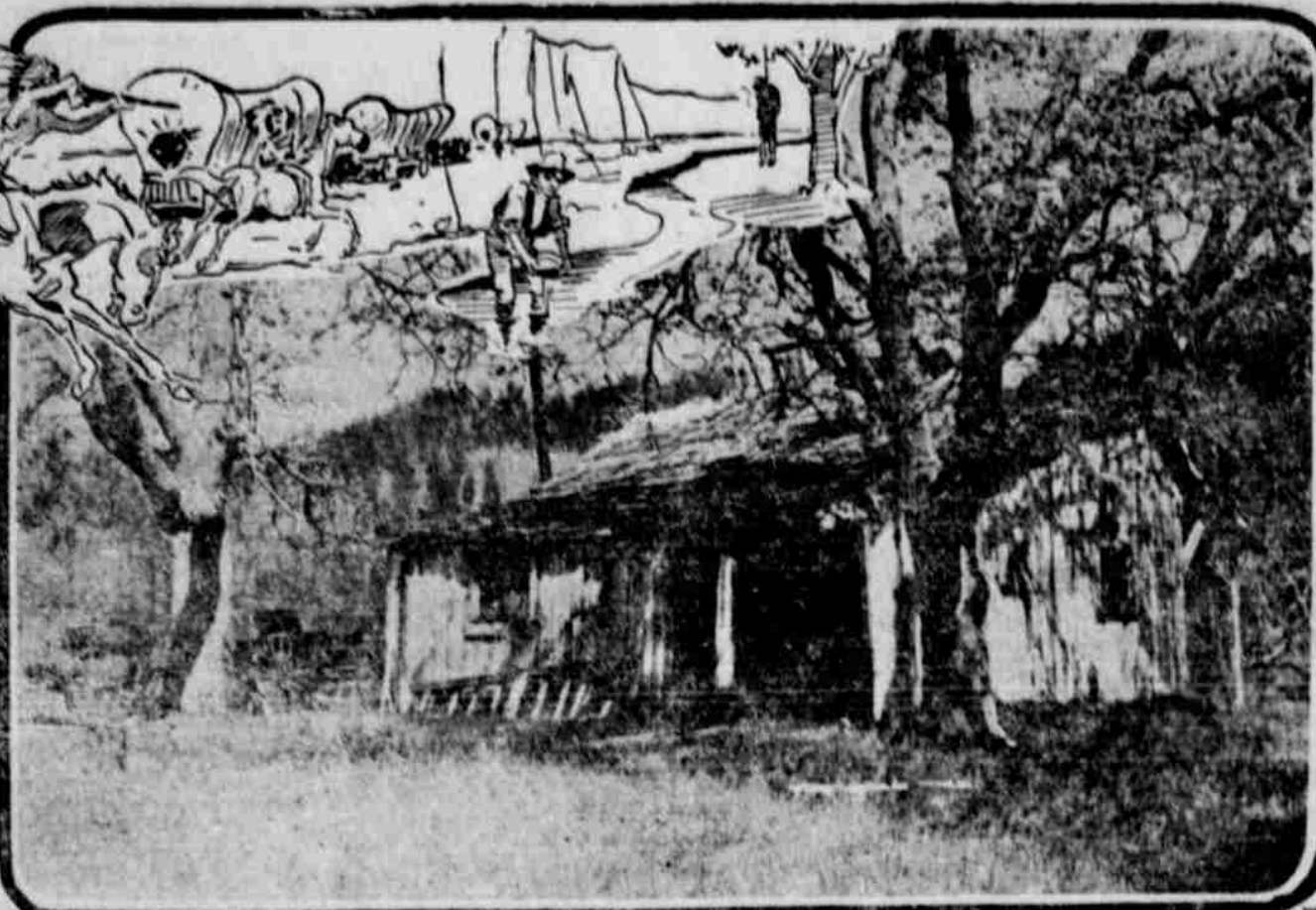
A REMINDER OF YESTERDAY

A few weeks later W. W. Fowler put up a log cabin, the first real house to go up in the new camp. Lumber was in immediate demand and woodmen who felled the nearby trees and whipsawed them into lumber sold the rough lumber for $250 a thousand.