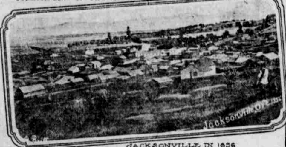
JACKSONVILLE IN 1856