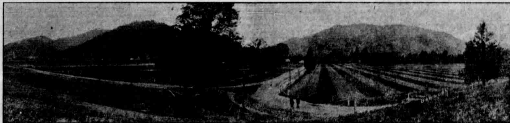
A Typical Rogue River Orchard Showing Town of Rogue River in Left Background.