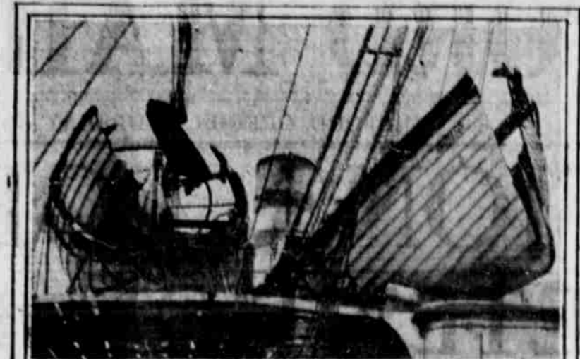
CRUSHED LIFE BOATS ON BOARD OF THE NOORDAM

The power of the sea to destroy was visible on the forward deck of the Noordam, of the Holland-America line, when she reached New York, in the form of two of her lifeboats, which three days after she left Rotterdam were ruined by a great sea which broke over the steamship's bows.